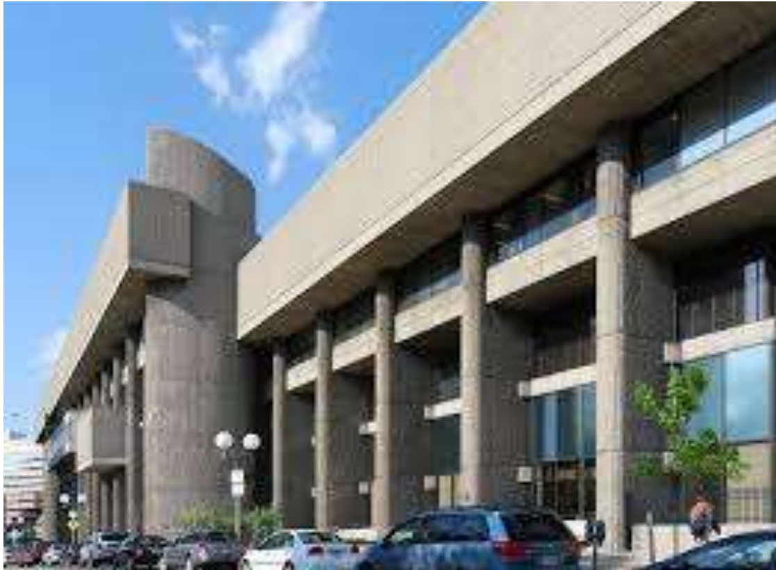
West End/Lindeman Center, where Guest 8 now resides