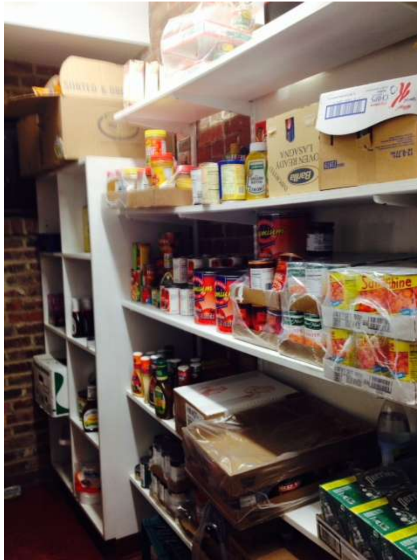
Pantry cleaned and organized by volunteer youth