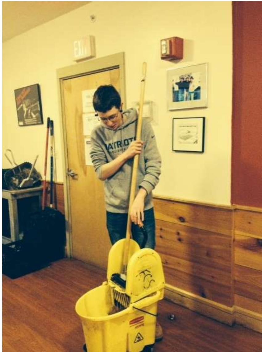
First Church Youth "making a difference" at FCS