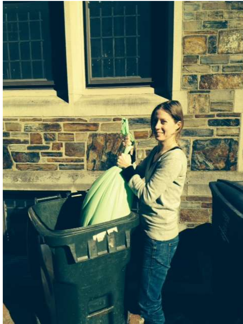
First Church Shelter participating First Church's Composting Program